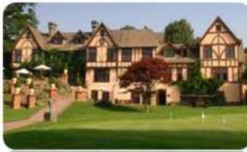
Mannings Heath Golf Club